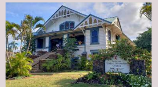
Lahaina United Methodist Church in 2021.