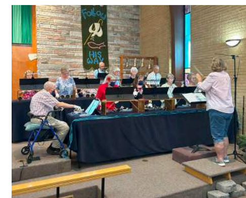
HOL HANDBELL CHOIR