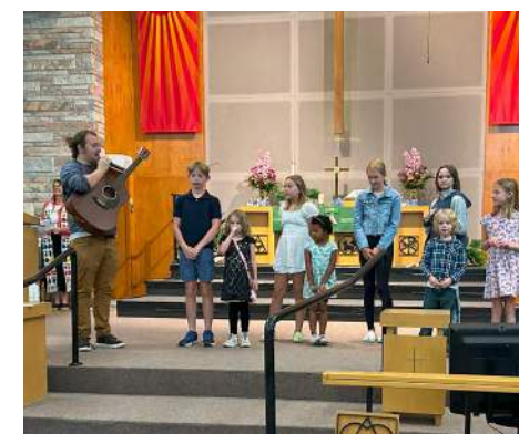
JOYFUL NOISE CHILDREN'S CHOIR