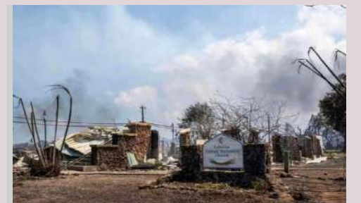
Lahaina United Methodist Church after the fire that hit Lahaina.

Do not forget to seek and lift up indigenous voices and perspectives in your efforts to help in relief and rebuilding efforts.