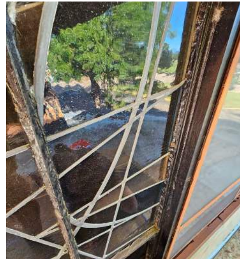
Looking down on a section of the window before it is cleaned. Look at the buildup of dirt and mud!