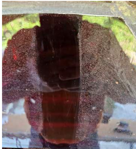
A section of glass from the Miracle Window. The middle has been scraped clean, but the two sides are still incredibly dirty!