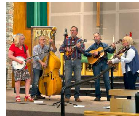
WELD COUNTY RAMBLERS