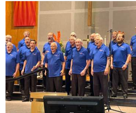
LONGS PEAK CHORUS

Special thanks to the many talented individuals and groups who shared the gift of music during worship service this summer!