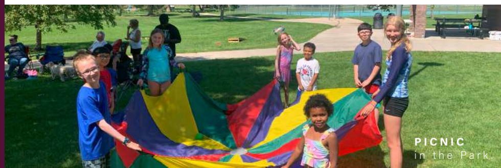
PICNIC In the Park